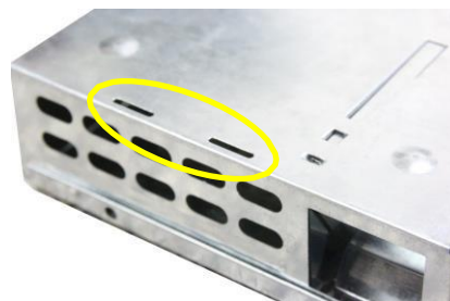
Holes on the bottom