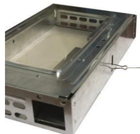
Fixing with snap-hook