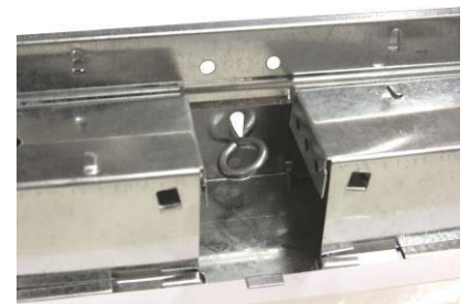
Fixing with screw