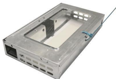
Fixing with detectable cable tie